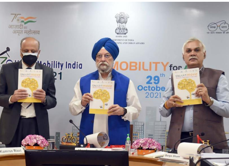
Shri Hardeep Singh Puri, the Hon'ble Union Minister, Ministry of Urban and Housing Affairs launching the Smart Move Compendium of top ideas 2021