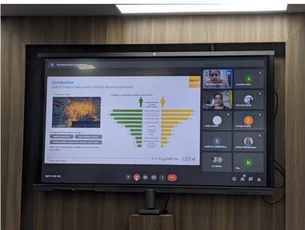
The second day of the virtual Grand Jury underway