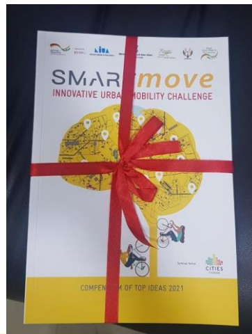
Smart Move Compendium of top ideas 2021