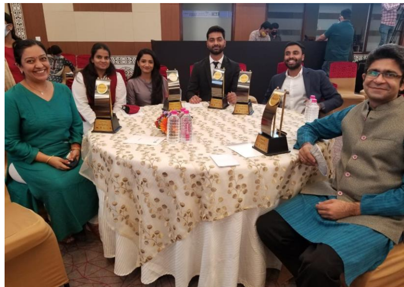
Winners of the Smart Move: Innovative Urban Mobility Challenge at the 14th Urban Mobility India (UMI) Conference held on 29th October 2021