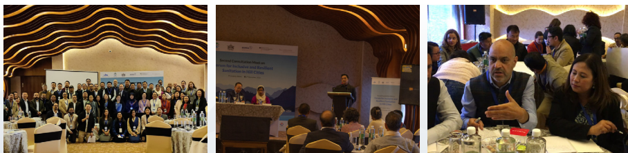
Figure 4: Photographs of second consultation meetings in Sikkim