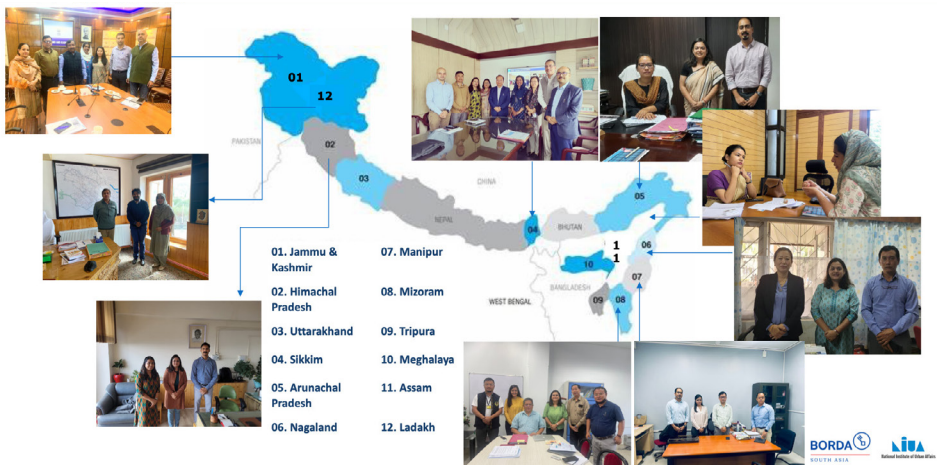
Figure 3: Meetings with state secretaries and directors of key public departments