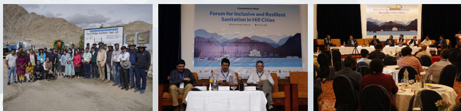
Figure 2: Photographs of the programme on first consultation meet in the Leh, Ladakh

The first consultation meeting was conducted with more than 40 WASH and Urban sector experts working in the Himalayan and North-Eastern region of India, on 14-15 July 2022 in Leh, Ladakh. The meeting was organised by NIUA in partnership with BORDA South Asia,