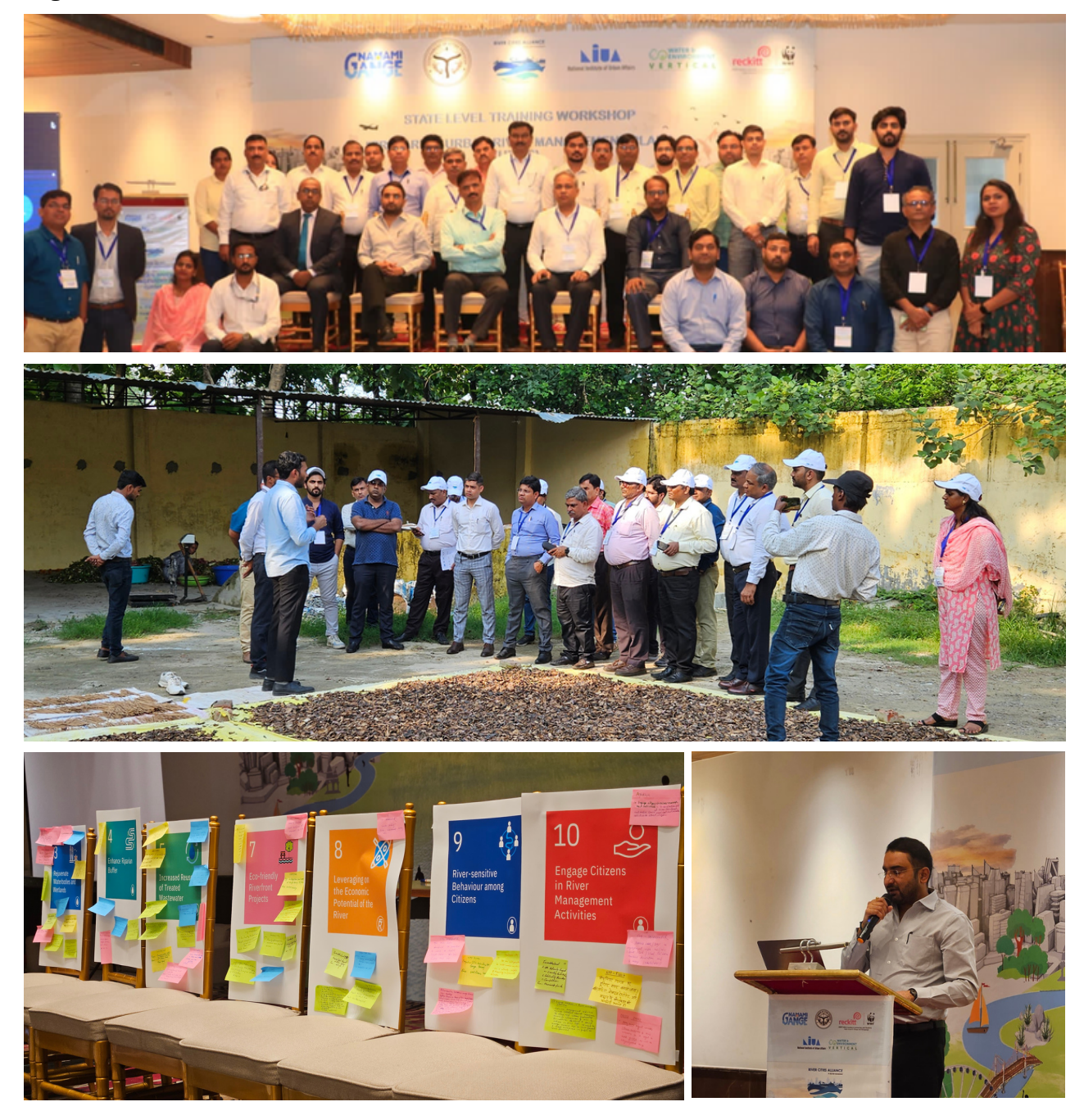
Glimpse of the 3-day training program on URMP

The training program aimed at fostering awareness on urban river management in 18 member cities of Uttar Pradesh, official onboarding of new member cities Pilibhit and Badaun in the RCA, exposure visit for participants to good practices by Ayodhya Nagar Nigam etc.