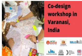
Snapshots from the workshop in Varanasi

The purpose of the workshop was to understand the state of inclusive design and accessible urban environment for persons with disabilities (PwDs) in Varanasi. 17 participants of varied impairments, age and gender attended the workshop, and shared their experiences and ideas to improve the city from the perspective of accessibility and inclusivity. For further details, click here .