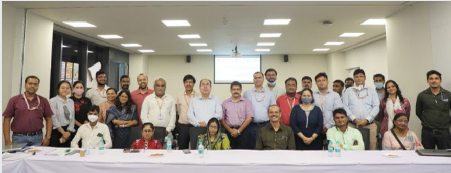
BASIIC Partners—Varanasi Smart City Limited, Global Disability Innovation Hub, and NIUA at Rudraksh Convention Centre Varanasi

The Building Accessible, Safe and Inclusive Indian Cities (BASIIC) programme at NIUA, along with its partners—Varanasi Smart City Limited (VSCL), and Global Disability Innovation Hub, London—organised a consultation in Varanasi on 7 September. The consultation was attended by key nodal officials from various government agencies in the city including—Varanasi Nagar Nigam, Town and Country Planning Department, Department of Empowerment for Persons with Disabilities, Tourism Department, Road Safety and Traffic Department, and Disabled Peoples' Organisations. The purpose of the consultation was to apprise the stakeholders of the initiatives being implemented in Varanasi, and mainstreaming disability inclusion across policy and project interventions. To read more about the consultation, click here .