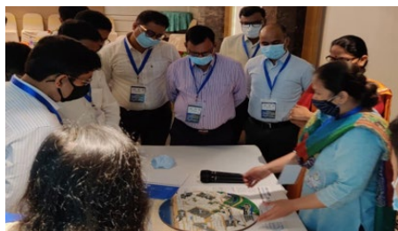
Participants being introduced to board-games to identify sanitation problems

The Sanitation Capacity Building Platform (SCBP) team at NIUA has collaborated with the All India Institute of Local Self-Governance to work on the planning and implementation aspects of faecal sludge and septage management. In this regard, the SCBP team organised an exposure visit to Odisha from 2-3 September, consisting of officials from Uttar Pradesh, Uttarakhand, Chhattisgarh, and Jharkhand. The key government officials and professionals from Odisha shared the knowledge and experience of the state-wide journey of scaling non-sewered sanitation followed by exposure visit to Sewage Treatment Plants at Bhubaneswar and Puri. For more information on SCBP, click here .