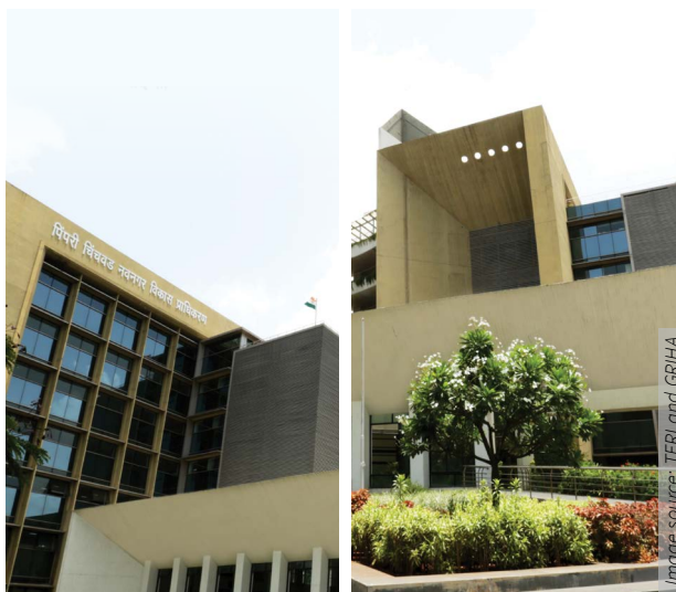
Pimpri Chinchwad New Town Development Authority with 5 Star Certification under the GRIHA green building rating system.

The Climate Centre for Cities (C-Cube) at NIUA, in collaboration with the World Resources Institute (WRI) is organising a 10-part learning series on Climate Change and Cities. The purpose of the learning series is to bring officials from cities and domain experts to discuss opportunities for building climate actions in cities. The fourth session of the series, with focus on Green Buildings for Resilient Cities was held on 5 August. The session introduced the concept of green buildings, and their significance in climate resilience. To watch complete video of the session, click here .