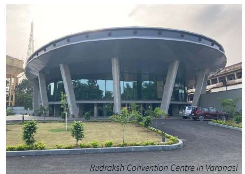
Rudraksh Convention Centre in Varanasi

The BASIIIC programme team conducted a visual audit of Rudraksh Convention Centre in Varanasi between 11 and 13 August. The team had discussion with officials from Varanasi Smart City Limited, Department of Persons with Disabilities, and the Tourism department to raise the efforts of making the city more accessible and inclusive. For more information on BASIIIC programme, click here .