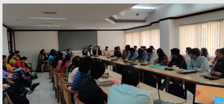
ISCF Cohort of 2020-21, during their induction program