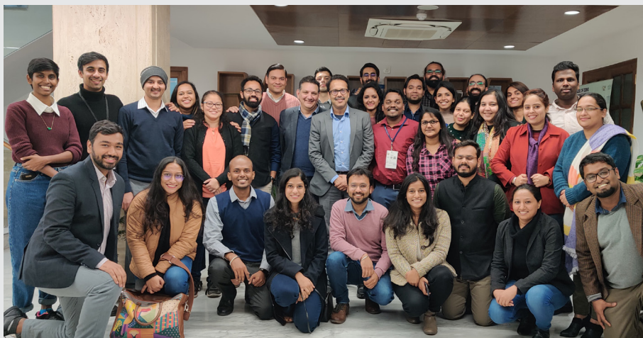
ISCF Cohort of 2019-20, after their mid-term project review

The India Smart Cities Fellowship (ISCF) is an initiative of the Smart Cities Mission which aims to cultivate youth leadership and vibrancy in the urban development sector. In 2019, 39 young professionals were inducted as Fellows, who applied their skills and experience to 12 projects in cities across the country by providing creative solutions to the pressing challenges faced by India's urban sector. The second cohort consisting of 57 Fellows was inducted in March 2020. For more information click here .