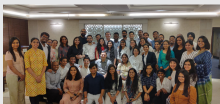
First year completion of ISCF batch 2019-20