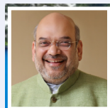
Hon'ble Home Minister Amit Shah