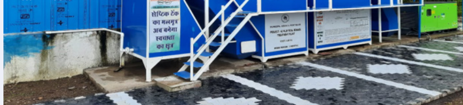
Faecal Sludge and Septage Management Collection-Transport and Treatment for Port Blair, Andaman & Nicobar Islands

Hon'ble Home Minister Amit Shah inaugurated the Faecal Sludge Treatment Plant (FSTP) for the city of Port Blair on 29 September. NIUA's Sanitation Capacity Building Platform (SCBP) Programme prepared the detailed project report for the FSTP in collaboration with ECOSAN Services Foundation. The plant is a combination of decentralised waste water and sewerage treatment solutions with a total treatment capacity of 42 kilo liters per day. For details on the FSTP in Port Blair, click here .