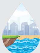
Urban River Management