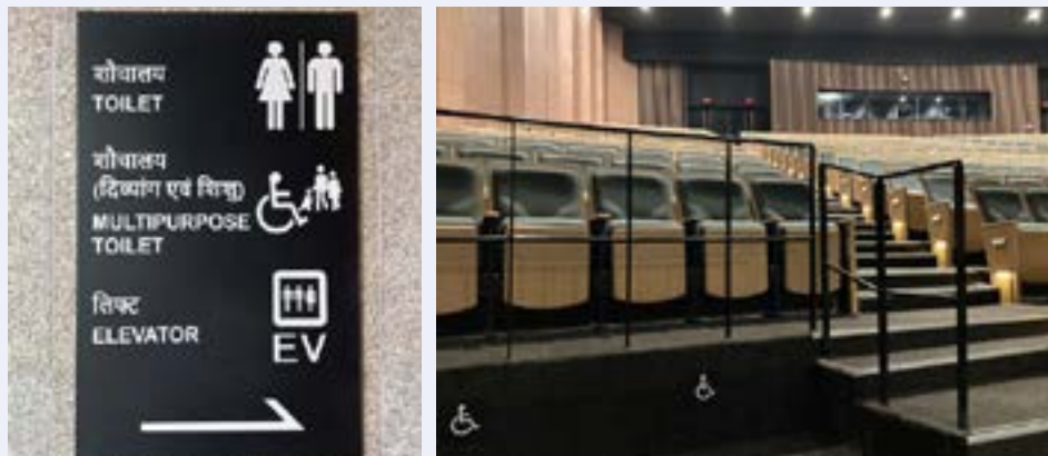
ADA compliant signage and wheelchair accessible seating spaces at Rudraksha Convention Centre, Varanasi

The Building Accessible Safe Inclusive Indian Cities (BASIIC) programme at NIUA supported by Foreign, Commonwealth and Development Office (FCDO), in association with the All India Institute of Local Self-Government (AIILSG) organised an e-dialogue titled Building Cities for All-A Perspective on Disability Inclusion in Urban Development on 31 January. The dialogue consisted of an expert panel exchanging ideas and set up discourses to develop universally accessible, and inclusive Indian cities. For details about BASIIC click here .