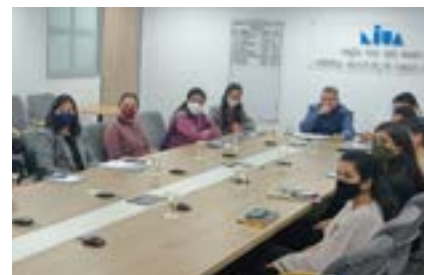
SIU and NIUA signing the MoU

NIUA has signed an MoU with the Symbiosis International University (SIU) on 31 January. The purpose of this collaboration is to connect academia with practitioners in the urban sector, and work in the areas of knowledge creation and capacity building.