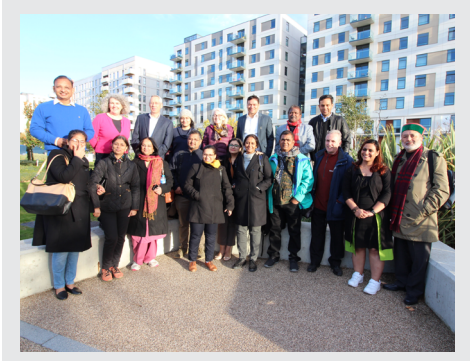
Study Tour to London in November 2018